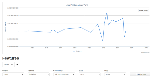
Figure 4: Explorative analysis tool

leverage insights gained from the second and third parts of the demonstration. This will mainly require smaller data sets so that jobs on the cluster can finish in reasonable time and code modifications that do not require extensive debugging.