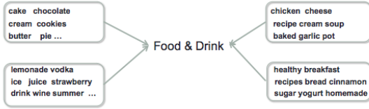
Figure 3: Topics related to Food & Drink category

Measuring Board Coherence: We now describe our board coherence estimation approach. Let \mathcal{T} = \{T_1, T_2, \dots, T_{|\mathcal{T}|}\} be the set of topics, where T_i is a topic (term cluster). Fig. 2 shows example topics T_1 = \{\text{cat, dog, owl}\} and T_2 = \{\text{cake, ring, shoe}\} . Let P be a pin represented by the set of terms in its descriptions, and B a board represented by the set of terms in all of its pin descriptions, i.e., B = \bigcup_j P_j . Given board B and topic set \mathcal{T} , we use an entropy-based measure to compute the topical diversity of a board, which reflects the number of relevant topics and how closely the pins in B adhere to them. A coherent board will have low topical diversity, while an incoherent one will have high diversity. Let P_i^B be the probability that B has pins from topic T_i :